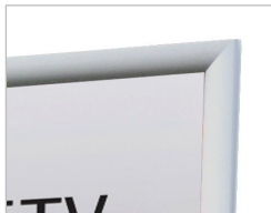
Anti-glare PET poster covers included.