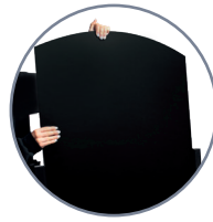
Slide-in reversible panels in either...