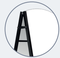
White aluminium composite (ACM) or Foam PVC.