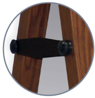
Stylish locking arms.