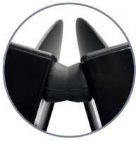
Hard wearing rubber hinges.